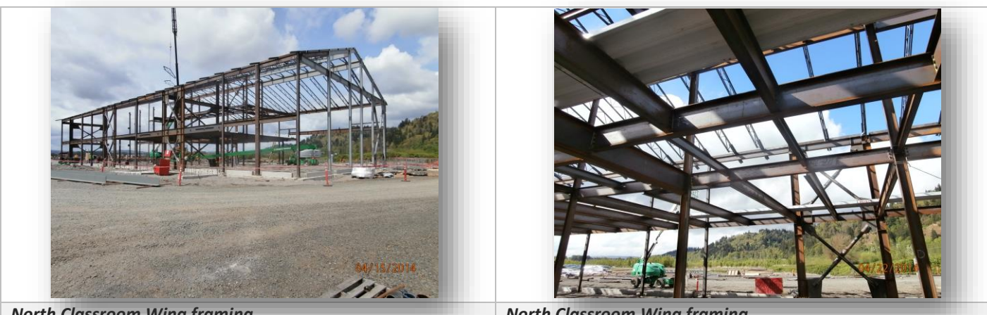
North Classroom Wing framing