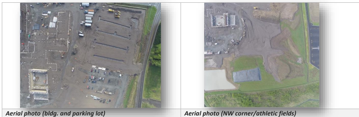
Aerial photo (NW corner/athletic fields)