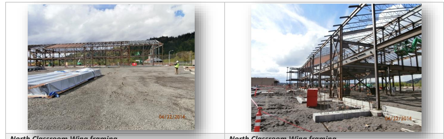
North Classroom Wing framing

Additional photos available via web camera access: www.dwpwebcams.com/whs/desktop.htm